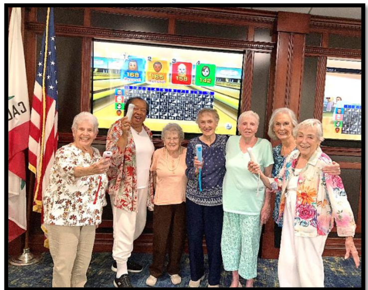
Photo of the Month Townhouse Wii Bowlers